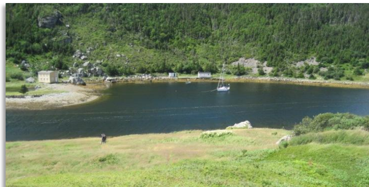
Staragan anchored north of Manning's Point at Little Harbour West.